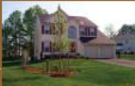
Residential Lot with Bioretention Somerset Development Prince George's County, MD