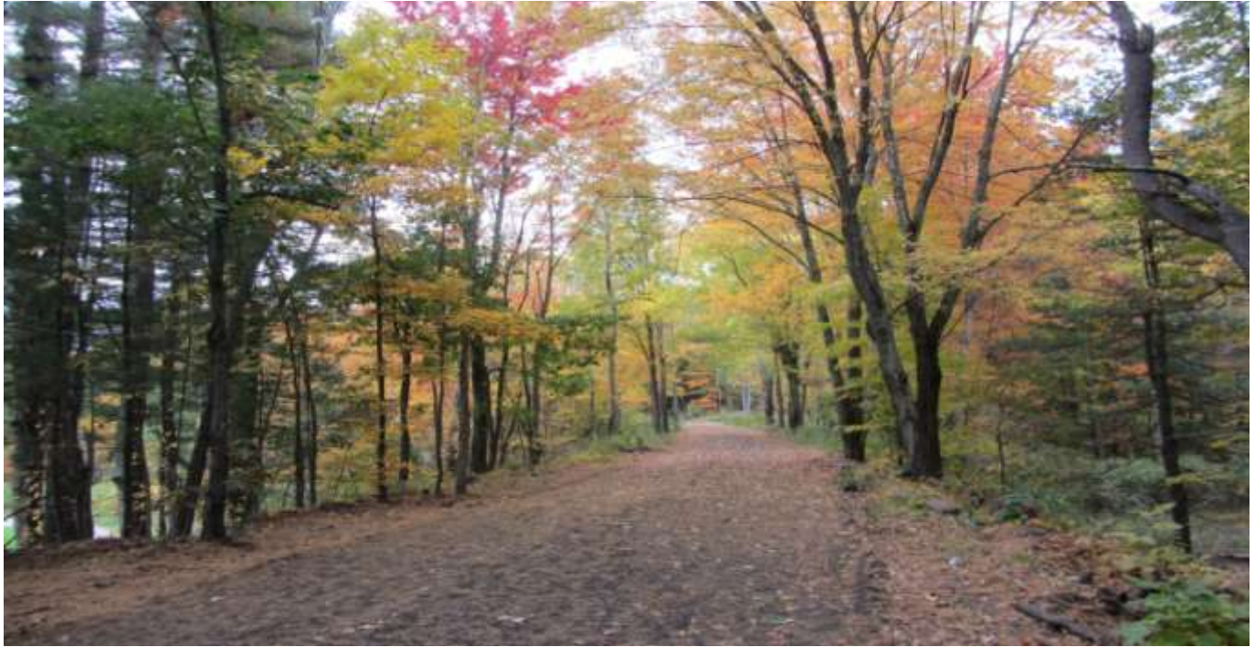
View of Spencer's Depot Trail