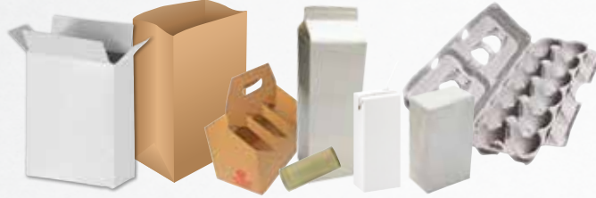
Boxboard and Paper Cartons (dry-food boxes, cores, paper bags, and egg, milk, and juice cartons)