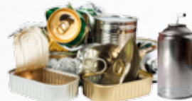
Empty Metal and Aerosol Cans (aluminum, tin, and foil)