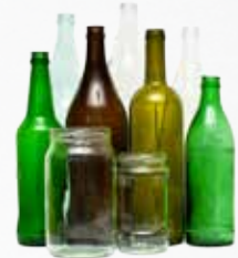
Glass Bottles (food jars and beverage)