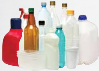
Plastic Containers (#1 - #7)