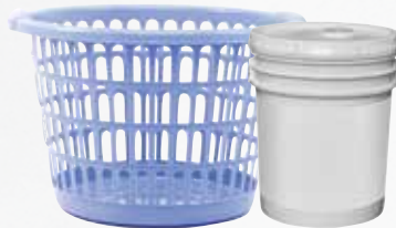
Large Rigid Plastics (5-gallon pails and laundry baskets)