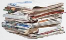
Newspaper (all sections and inserts)