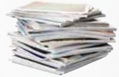
Magazines and Phone Books (catalogs and soft cover books)