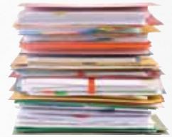
File Folders and Office Paper (all colors)