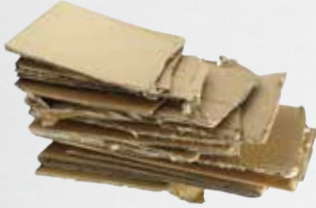
Corrugated Cardboard (wavy center layer)